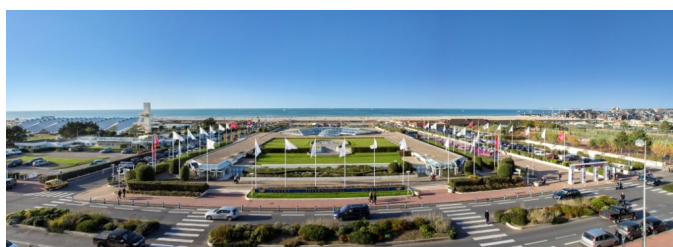
The C.I.D. - placed underground so as not to spoil the beautiful sea view

IIRB congresses are appreciated as the international platform for knowledge transfer and networking in the sugar beet sector. Current research on sugar beet cultivation will be presented, and the exciting setting will surely contribute to the attractiveness of the congress.