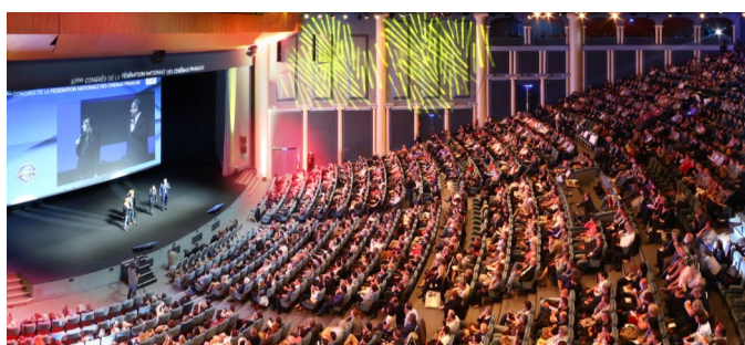
C.I.D. - the main auditorium

Pre and post congress tours in the Paris and Normandy region, and an accompanying persons programme around Deauville will be offered that allow congress participants and accompanying persons to explore some of the famous French sites of touristic interest.