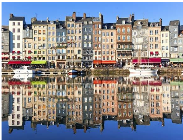
Harbour of Honfleur