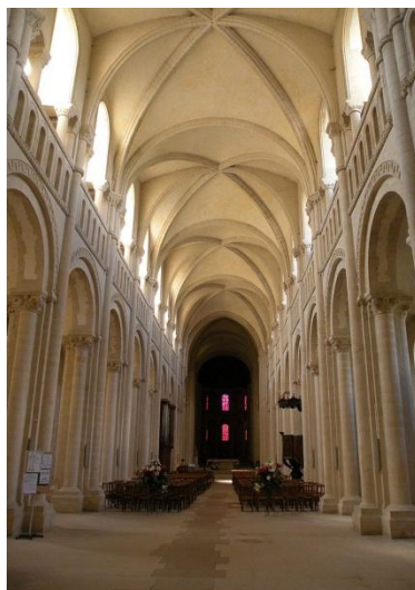
Trinity Church (Abbaye-aux-Dames)