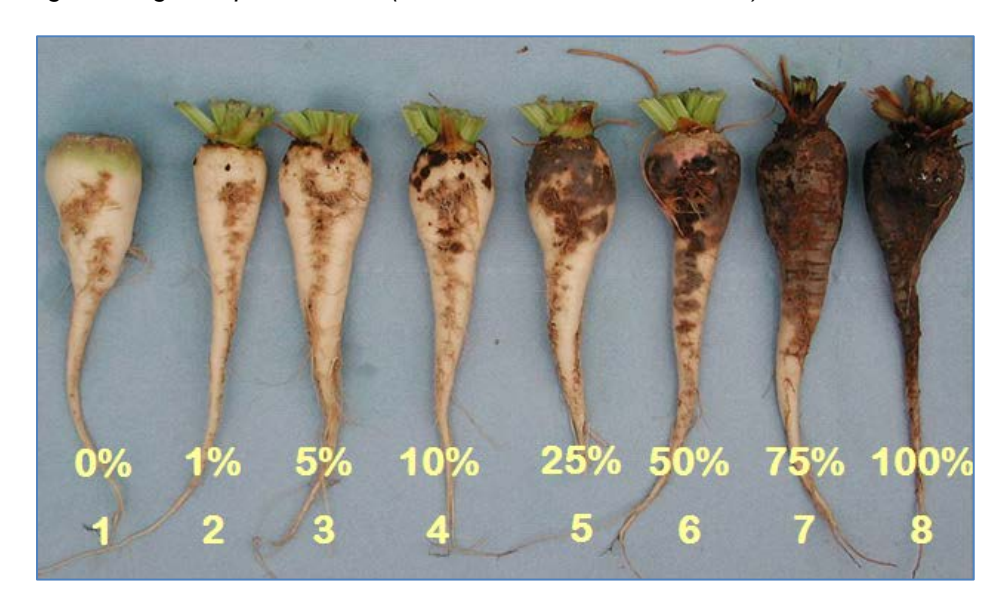
Figure 2. Proposed scoring scheme for the infestation with moulds and rots after storage. The original scoring scheme has been developed for Rhizoctonia, but it can also be used for other disorders at the beet surface (C. Hoffmann, personal communication).